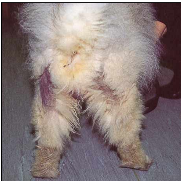
8.8 Bilaterally symmetrical alopecia with intense hyperpigmentation on the caudal aspect of the thighs in a 3-year-old Chow Chow with alopecia X.

These names reflect the lack of clear understanding of the pathogenesis, although recent data suggest that this condition is associated with mild pituitary-dependent hyperadrenocorticism (Cerundolo et al. , 2001). Alopecia is often first observed between 1 and 5 years of age. Both male and female, neutered and entire, dogs are affected. Symmetrical alopecia affects the trunk, caudal thighs, perineum or neck, and changes in coat colour and coat quality may also be seen (Figure 8.8). Hair regrowth is often observed at sites of trauma, such as skin biopsy sites.